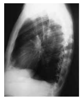
FIGURE 2. Lateral chest X-ray of 65 year-old male smoker.